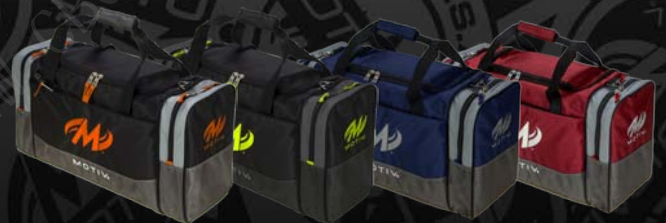
ITEM NUMBER: MTVG205KO