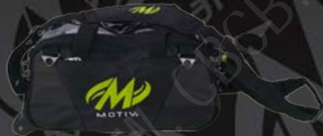
ITEM NUMBER: MTVG2BXGL