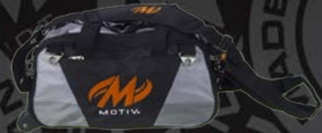
ITEM NUMBER: MTVG2BXKO