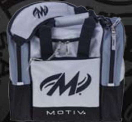
ITEM NUMBER: MTVG104SV