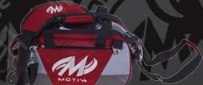
ITEM NUMBER: MTVG2BXRD