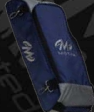
ITEM NUMBER: MTVGOBXNV