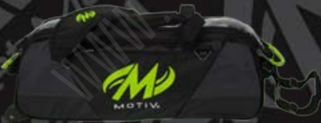
ITEM NUMBER: MTVG3BXGL