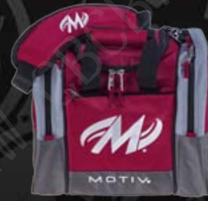
ITEM NUMBER: MTVG104RD