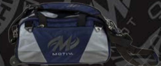
ITEM NUMBER: MTVG2BXNV