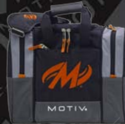
ITEM NUMBER: MTVG104KO