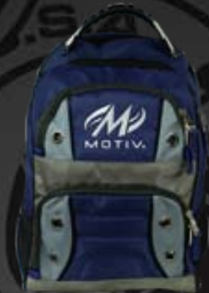
ITEM NUMBER: MTVG005NV