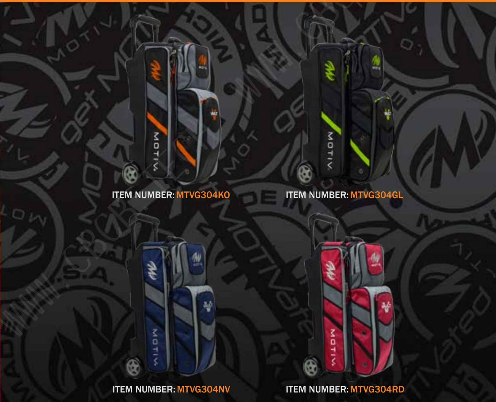
ITEM NUMBER: MTVG304KO