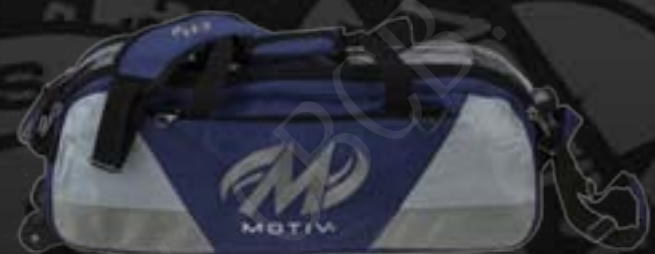
ITEM NUMBER: MTVG3BXNV