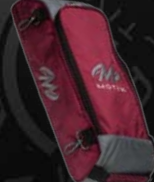
ITEM NUMBER: MTVGOBXRD