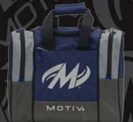
ITEM NUMBER: MTVG104NV