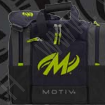
ITEM NUMBER: MTVG104GL