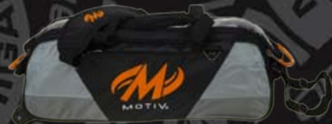
ITEM NUMBER: MTVG3BXKO