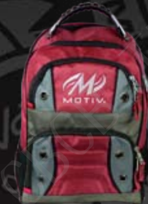
ITEM NUMBER: MTVG005RD