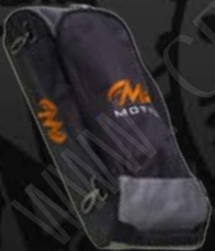
ITEM NUMBER: MTVGOBXKO