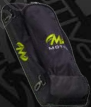
ITEM NUMBER: MTVGOBXGL