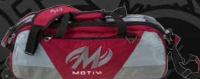
ITEM NUMBER: MTVG3BXRD