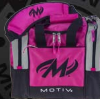
ITEM NUMBER: MTVG104HP