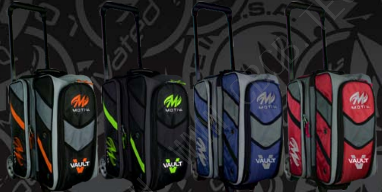
ITEM NUMBER: MTVG204KO